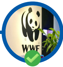
Not-for-profit/ Non-government organisations